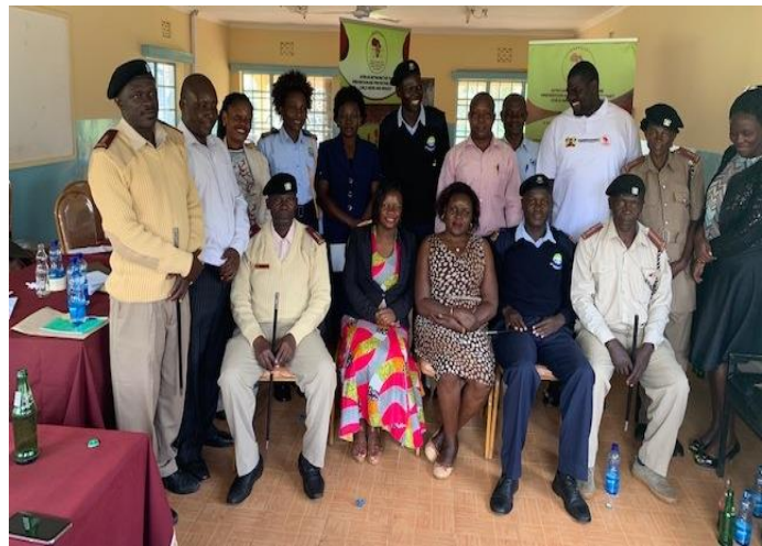
Community discussions in Matayos Sub County

The objective of this activity was to gather information from community leaders and members on manifestations and trends of Commercial Sexual Exploitation of Children in Matayos and existing structures being used to address the vice. Fifty two (52) community members attended (25 male, 27Female) the meeting and the participants included area chiefs,