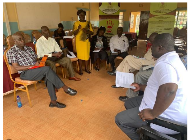
Community discussions with Head Teachers