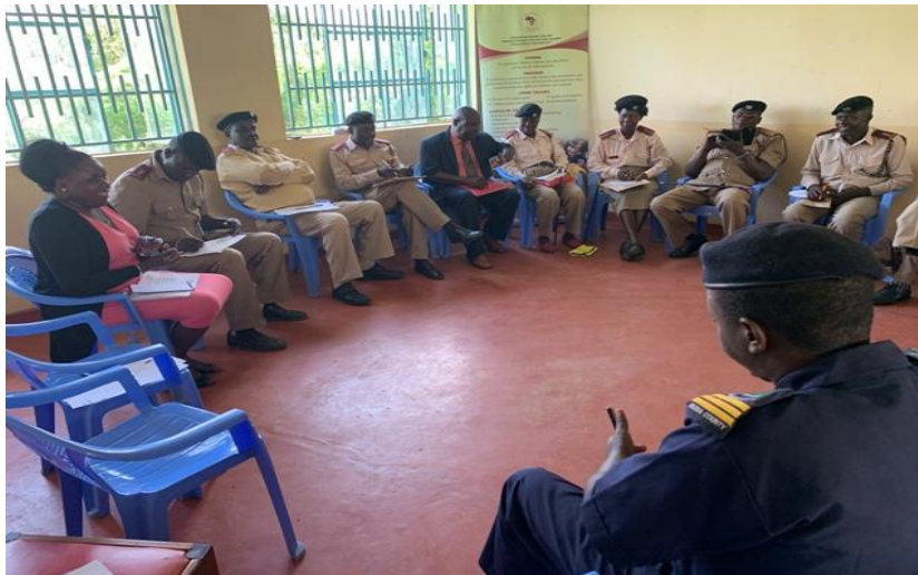
Area Chiefs during Focused Group Discussion in Budalangi Sub County

participation and five groups were formed based on their level of education with each group having ten members to enhance participation of members. The five groups were composed of local authority in the area (chiefs, assistant chiefs and administrators), Teachers, Parents and Local Civil Society Organizations and church leaders. To guide the discussions, four questions were formulated based on the 4 main P's (Prevention, Protection, Provision and Participation).