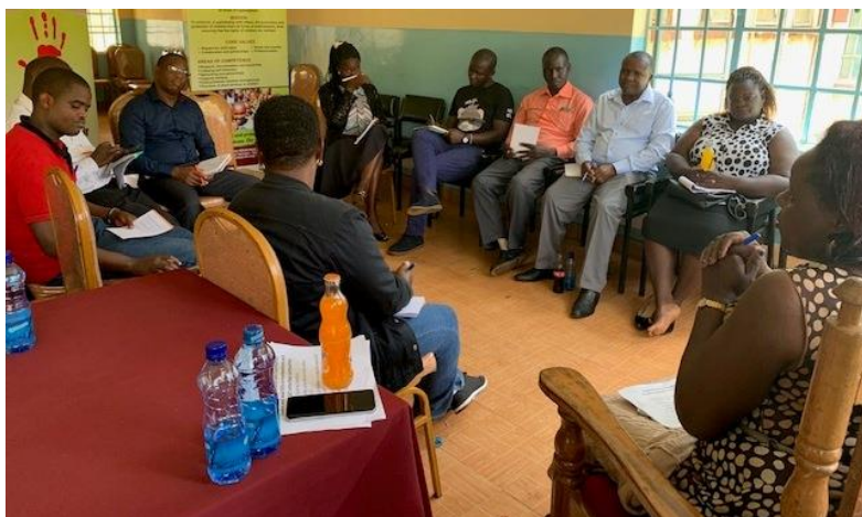
Community discussions with local Civil Society

The local CSO's included Mwendo Organization, Adolescence Reproductive Awareness Organization, Family Life Empowerment Program, Busia Sex Workers' Survivors, MACT, Long Distance Drivers' Association, Boda Boda Association chairman, REEP, Women Rights Champions and Money Changer Forex. This team acknowledged CSEC