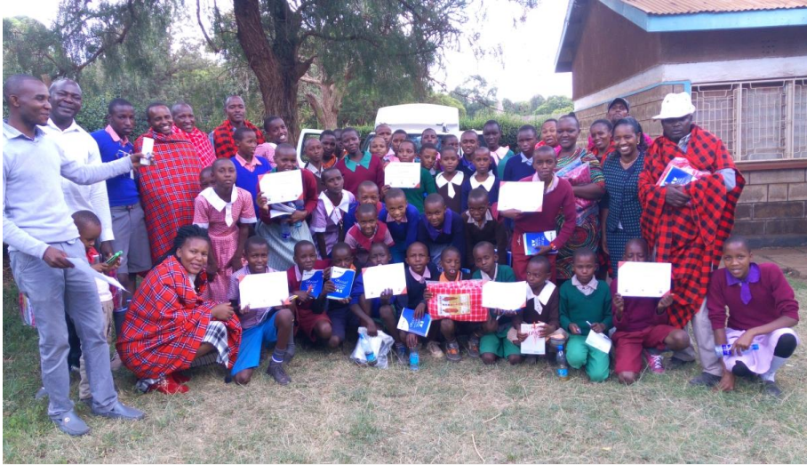
Child Rights Club members from 10 schools in Child Participation programme, Club Patrons, Child Help Desk Teachers in Loitokitok, posing for a photo on 16th March 2019 after the Review training