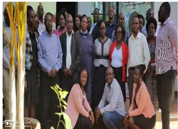
Commercial Sexual Exploitation of Children

The project was launched in October 2019 in Busia with the aim of introducing it to key stakeholders within the County for partnership and engagement at the onset to obtain their goodwill and participation. The meeting also provided an opportunity for the consultant from Move on Africa to disseminate the findings of their Rapid Assessment on Commercial Sexual Exploitation of Children, which was undertaken in the region.