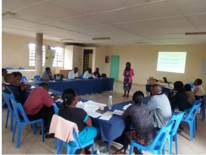
Training of teachers from nine schools in Dagoretti Sub County on child sexual exploitation held in April 2019 at Maisha Poa Centre, Dagoretti