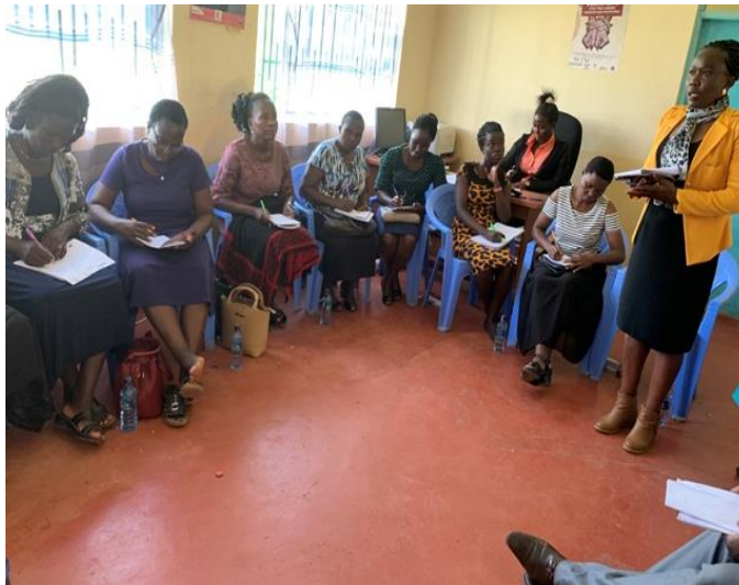
Teachers during Focused Group Discussion in Budalangi Sub County

Chiefs reported to be receiving cases of sexual abuse within their community. When this happens, they refer the victims to hospital for medical services and later on report the case to the police. However, they noted some of these cases are not reported especially where parents are not alive or around and only learn later when the victim has become pregnant. Teachers noted one major cause for school dropout is teenage pregnancy. When the abuse