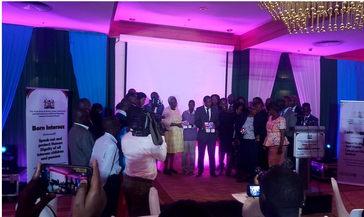
Launch of the the Final Report on Legal, policy, Institutional and Administrative Reforms regarding Intersex Persons in Kenya.

The year saw ANPPCAN being invited by a number of partners and collaborators to participate in their meetings. Such meetings provide ANPPCAN staff with the opportunity to learn and share experiences. As such, ANPPCAN participated in the public launch of the report of the Taskforce on Legal, Policy, Institutional and Administrative Reforms regarding Intersex Persons in Kenya. The Task Force needed information on the role of CSOs in advocating for the protection and equal treatment of intersex persons, especially children. In this forum, parents were advised to wait until children got to puberty to be able to determine the dominant sexual characteristic and to let the intersex child decide on what they prefer, before the operation.