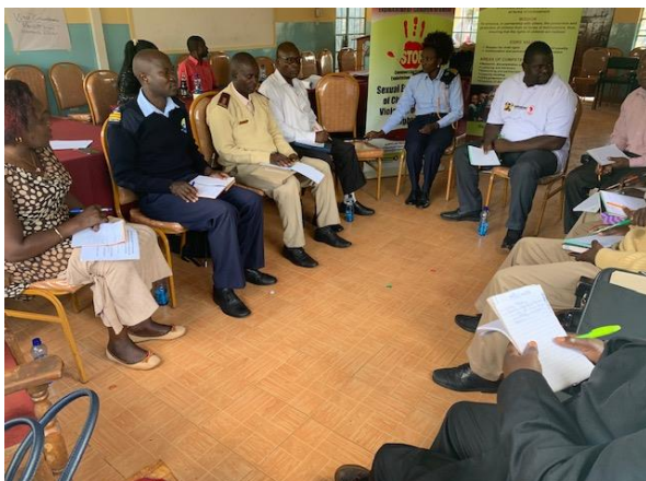
Community discussions with chiefs and ward administrators

From the discussions, it was noted that Commercial Sexual Exploitation of Children happen both at home, school, along the Busia Uganda Highway and in Busia town, especially during market days. The truck drivers have formed a cartel that they linked up with young girls in the small lodgings or in their trucks, since they travel with beddings.