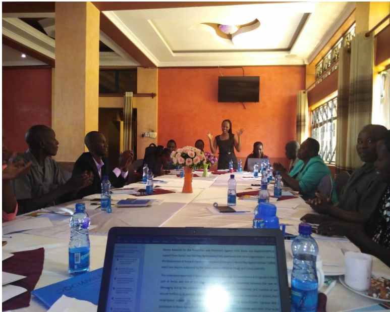
A law enforcement meeting in Busia

The year saw 78 law enforcement officers being reached in Marsabit, Busia and Nairobi, where they were given opportunity to express issues of concern as they deliver services to their communities.