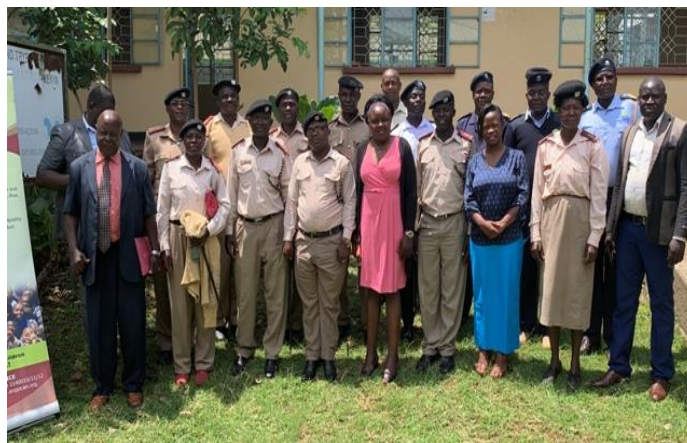
Chiefs, Assistant Chiefs and Ward Administrators during a Community Conversation in Budalangi

The objective of this activity was to gather information from community leaders and members on manifestations and trends of Commercial Sexual Exploitation of Children in Budalangi and existing structures being used to address the vice. Fifty five (55) community members attended (27 male, 28 Female) the meeting. Participants included chiefs and assistant chiefs from the seven locations in the sub-County. Also in attendance were teachers from the local primary schools, Civil Society Organizations, Faith Based leaders and Parents. Focus Group Discussion strategy was adopted to enhance