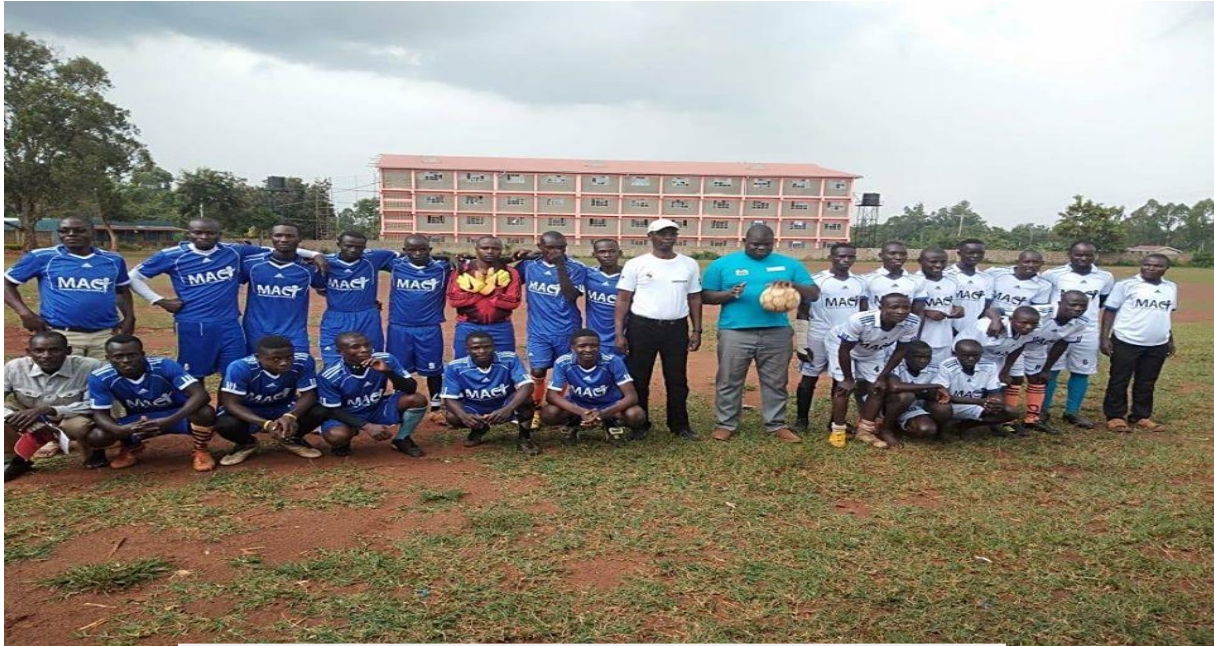
The youth in Busia posing in their uniforms during a football tournament

The project also engaged 45 school heads and teachers from 15 schools in Teso South (Busia), Marsabit and Mandera and informed and trained them on child trafficking and roles they can play to prevent and protect children from such exploitations. The teachers were informed on how to establish and run Child Help Desks in their schools to involve teachers and children in child protection.