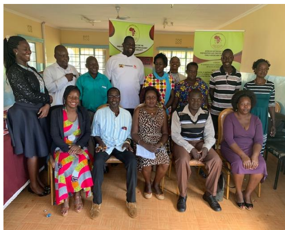
Community discussions with parents

Parents noted that sexual and other forms of exploitation of children is a problem, especially in Busia town and cited slum areas, chang'aa dens, video dens, schools and families where parents are missing and families with high poverty levels, where children face the exploitation. They noted that despite primary education, many children, especially girls when they reach the age 12 years start interacting with their peers and young men who give them food, free rides to school, purchase them school uniforms and home clothes and some of them give them food, which they bring home to their younger siblings and eventually drop out of school.