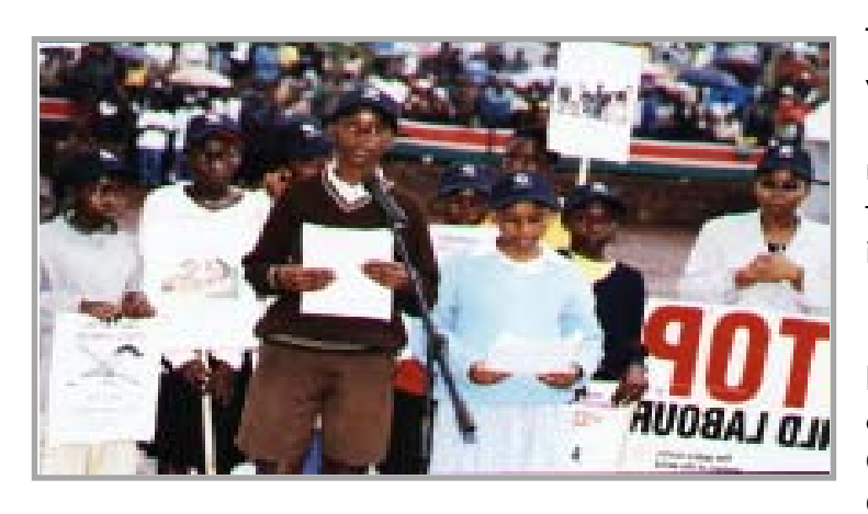
Children sharing their views on child labour during Labour Day celebrations at Uhuru Park, Nairobi