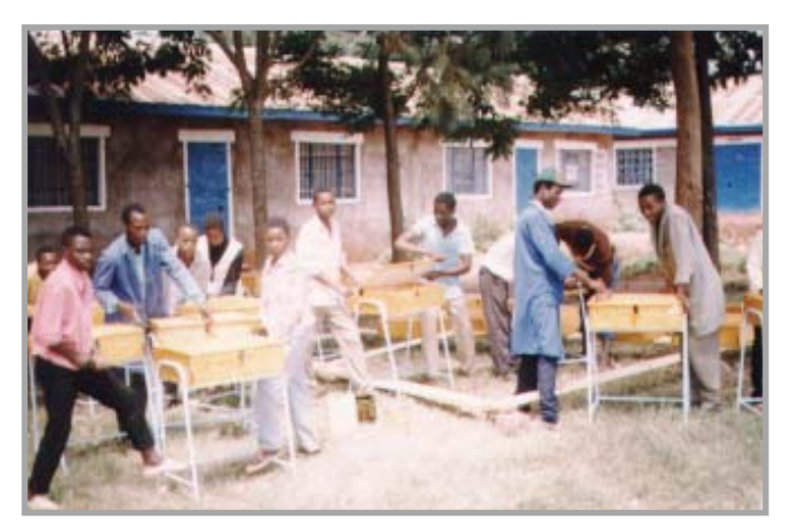
Children withdrawn from child labour by the Department being supported for skills training at Nyaga Polytechnic, Kiambu District

In the year, a new project 'Combating Child Labour through Strengthening the Capacity of Communities for Direct Action against the Worst Forms of Child Labour' targeting child labour in Bondo and Siaya districts was launched. Supported by the International Labour Organisation's International Programme for the Elimination of Child Labour (ILO/IPEC), the programme aims at decentralizing the district child labour committees to the community level and also building the capacity for local level advocacy against the worst forms of child labour in the two districts.