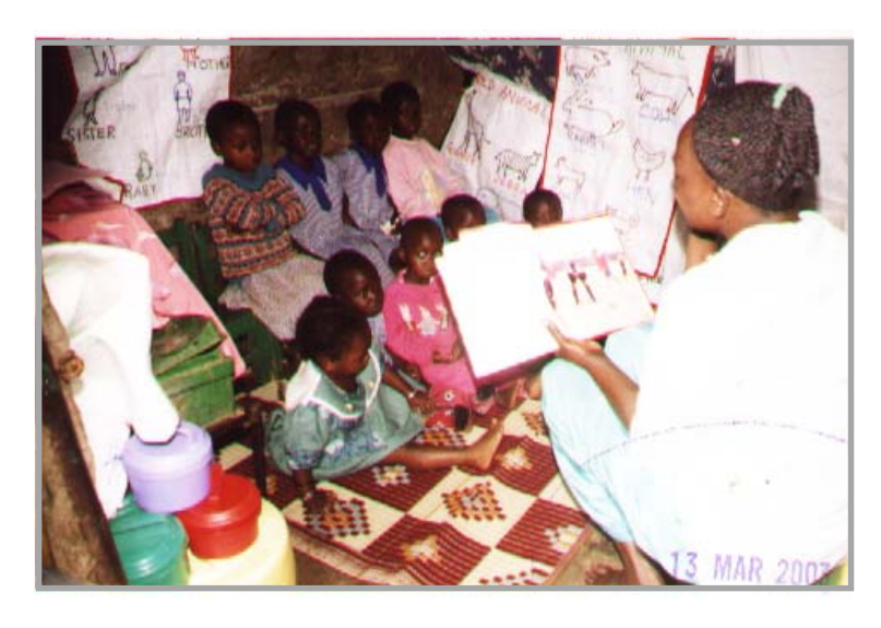
A Day Care Mother reading to children in her centre, in Gitathuru Village

The findings were shared with stakeholders in a workshop, which included the City Education Department, TAK - Korogocho, the local administration, PREMESE Africa, the Old Mutual Bank and ANPPCAN Head Office. The stakeholders endorsed the recommendations and agreed that a training to address the identified gaps was necessary and would best be done by PREMESE Africa in collaboration with ANPPCAN Head Office. In June, a training proposal was developed jointly by the two partners.