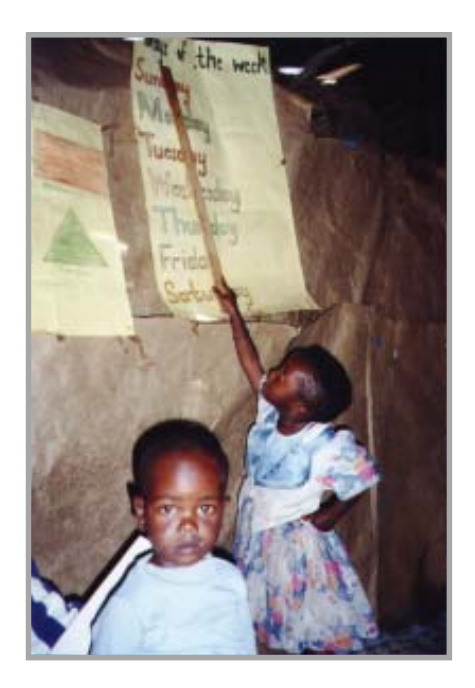
Children learning in a homebased day care centre

During the reporting period, the Home Based Day Care Centres' project continued to work towards the best interest of the child. Given that the issue of sustainability of the project has been a key concern, it was found necessary to train the TAK Day Care Management Committee (DCMC) and the people living within the child's sphere in Korogocho.