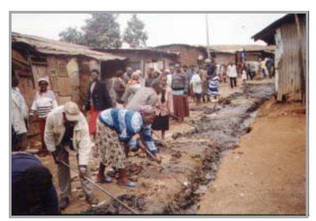
Past efforts by the COT programme in mobilising the Kibera Community to clean their environment. This will now be extended to Mukuru Community

The COT programme entered Mukuru Community towards the end of the year. Initial activities involved the collection of preliminary data about the community and building the profile of the community that would be useful in determining the kind of introduction and the direction the programme would take. Within the Mukuru Group of Slums, the COT programme made contacts with various NGOs, church organisations and other institutions working there. Contact was also established with training institutions such as schools, clinics and community groups. This mode of community entry provided an opportunity to establish rapport with as many people as possible and aided in the sourcing