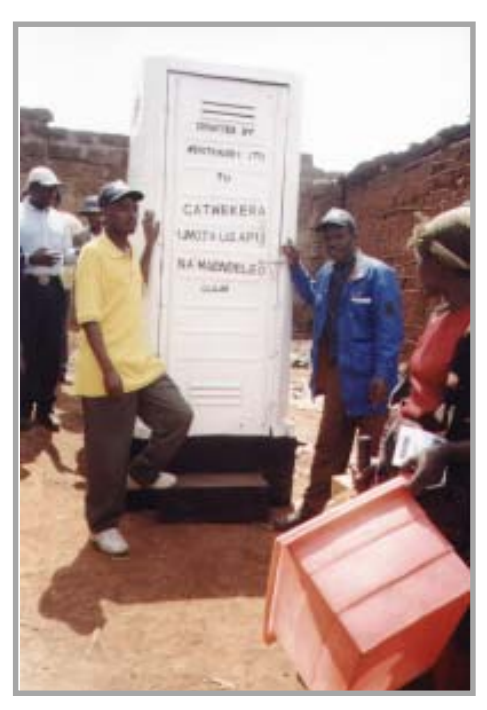
Members of Gatwekera CBO in Kibera Community receive a mobile toilet unit donated by Kentainers

In the year under review, the programme conducted six training workshops for Kibera community based organisations (CBOs). The underlying objective of these training workshops was to enhance the skills of the leaders and members of the CBOs with a view to improving their performance in the community in which they operate. In addition, the forum was also used to effectively re-orient the CBOs towards sustainability and independence given that the COT programme was planning to exit the area for Mukuru Community.