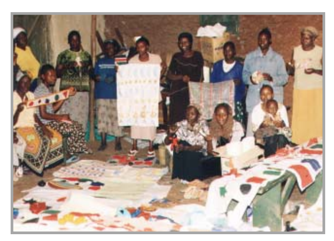
Day Care Mothers display materials they developed during the material development workhop organised by NACECE in April

Information is power and training sharpens skills to respond to situations and needs of children. In the month of April, 31 Day Care Mothers benefited from a three-day training on material development conducted in Korogocho and facilitated by 2 officers from the National Centre for Early Childhood Education (NACECE). After the training, Day Care Mothers are now able to make play and learning materials for the children.