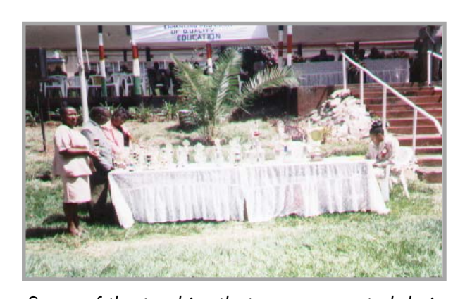
Some of the trophies that were presented during the Education Day in Kiambu District

ANPPCAN has been working very closely with schools and communities to withdraw children from child labour and to prevent those at risk of joining child labour. One of its main strategy in tackling child labour is to promote withdrawal of children engaged in child labour and sending them back to school. ANPPCAN works in several districts, which are considered to be source areas of child labour. The project works to empower schools to come up with income generation activities (IGAs), which if managed properly, support children at risk of joining child labour owing to financial requirements by the school or support children withdrawn from child labour situations. During the Global Action for Education Week, activities were organized to promote best practice in withdrawing children from child labour situations and retaining them in schools.