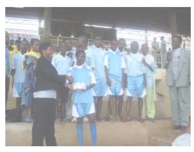
A football match was organised as one way of marking the Universal Children's Day. The ANPPCAN's Violence project used the occasion to drum home the need to stop violence against children.