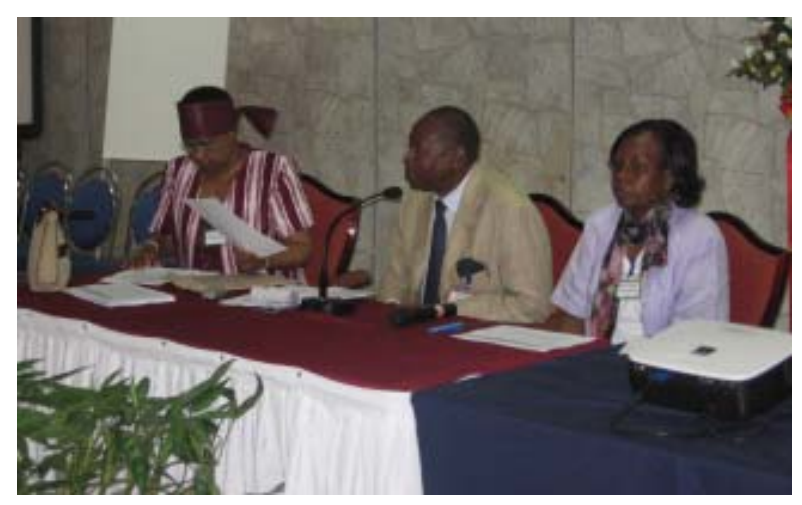
Directors from ANPPCAN Head Office and a participant from Uganda (in the middle) during the Fifth African Conference on Child Abuse and Neglect in Kampala, Uganda.