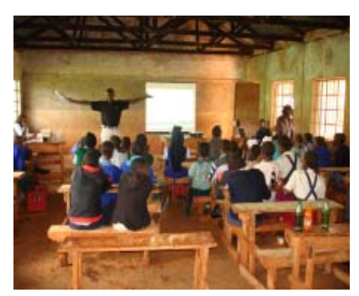
Mentor session: child rights club members being mentored

communication skills and attitudinal change, leadership and advocacy skills to enable them become effective advocates of their rights.