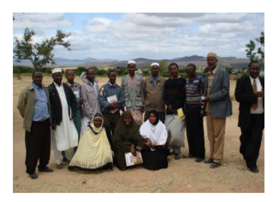
Some of the DCLCs members who were trained on child rights and protection including combating child trafficking in Moyale District.

Further, productive networks on child trafficking were established and strengthened both at the project communities and at the national level. Meetings were held with international stakeholders such as the International Organization of Migration (IOM), United Nations Children's Fund (UNICEF), the United Nations Office for Drugs and Crimes and the International Labour Organisation (ILO). Information, communication and education (IEC) materials on child including posters and flyers were shared during these meetings.