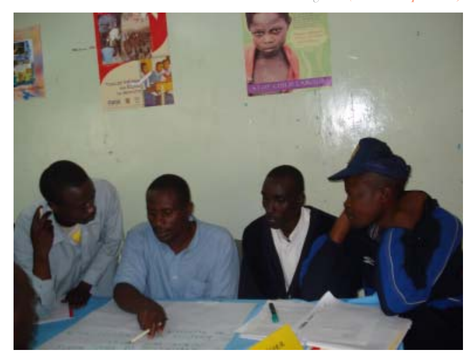
Group activity for the matatu operators during the sensitisation training on child sexual abuse and exploitation at the Kenya Polytechnic, Nairobi

In the year under review, Ecpik lobbied the government to introduce legislation on cyber crimes and mobile pornography. It held meetings with two key players in the telecommunication industry, that is, the Communication Commission of Kenya and Telkom Kenya. The two players pledged to support Ecpik in her endeavour to have a safer internet for Children.