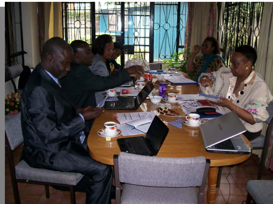
Heads of ANPPCAN Chapters in Senegal, Ghana, Mozambique and Tanzania during the planning meeting for the Capacity Building Programme at ANPPCAN Regional Office, Nairobi

The overall objective of the project is to enhance the capacity of ANPPCAN Regional Office and its