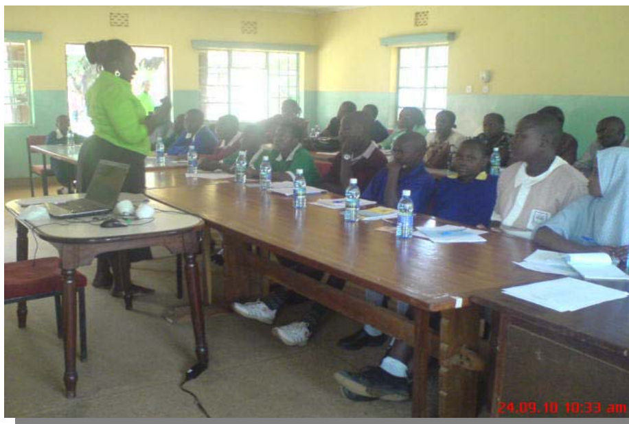
Child Help Desk representatives from Busia District attending a training on running and management of a Child Help Desk

This training attracted Child Help Desk representatives from 20 schools that included children and teachers. Some 40 children and 30 teachers attended the training. Emphasis was placed on case reporting, documentation and referral of cases at the Child Help Desk.