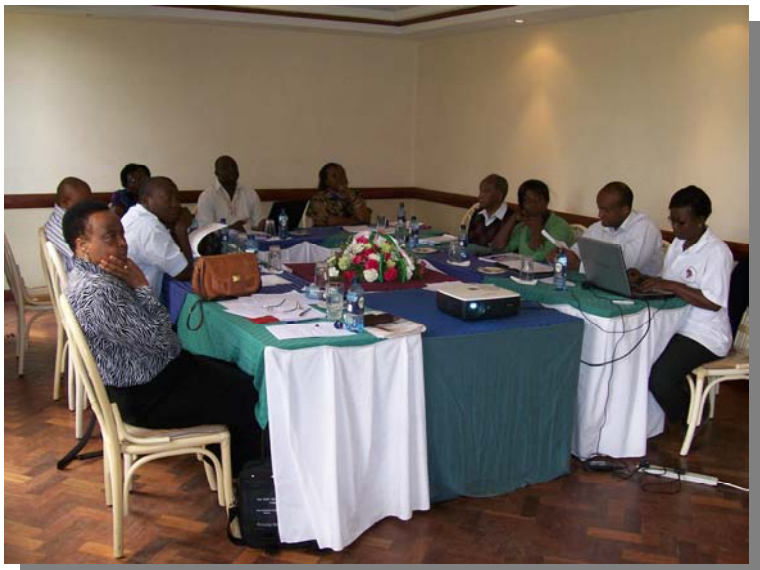
Heads of ANPPCAN Chapters taking part in the Planning Meeting of the Exchange programme in Nairobi, Kenya in the past

In the year under review, the Exchange programme took place between the ANPPCAN Regional Office and six of its chapters, namely, Ethiopia, Ghana, Kenya, Liberia, Uganda and Zambia. The programme began in January 2010 and ended in January 2011. This was the eighth phase of the programme and had 8 participants taking part.