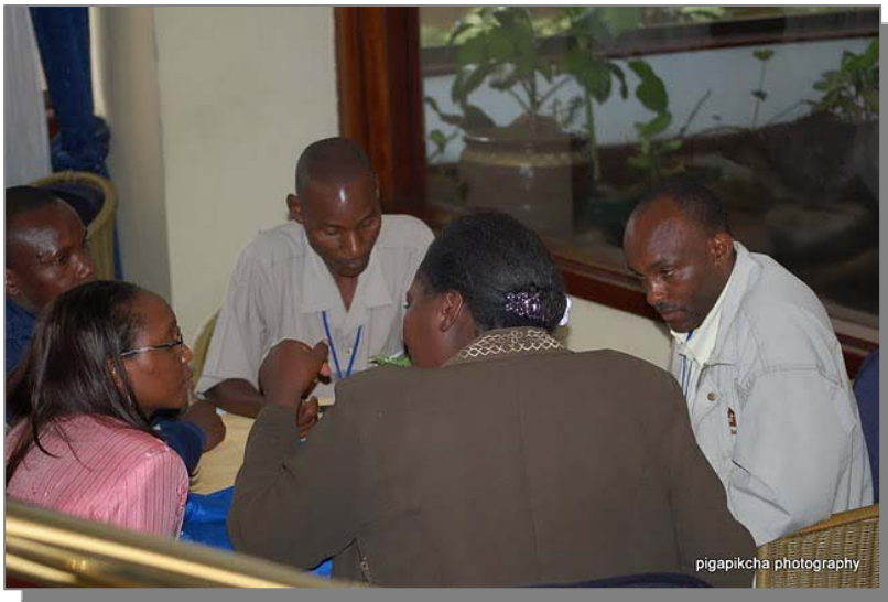
Some of the tour operators who attended the training on Child Sex Tourism organized by ECPIK

ECPIK was invited by INTREPID Guerba Tours and Travels (Australia) to conduct a training session on child sex tourism (CST) to their chain of tour operators. The training was conducted at the Milimani Hotel (Kenya) in which some 40 tour and travel operators attended. This was a strategic forum since the baseline survey on CST had identified the tour guides and operators as some of the agents of CST. Therefore, through the training, ECPIK directly reached one of the key stakeholders on child sex tourism, prostitution, pornography and trafficking for sexual purposes.