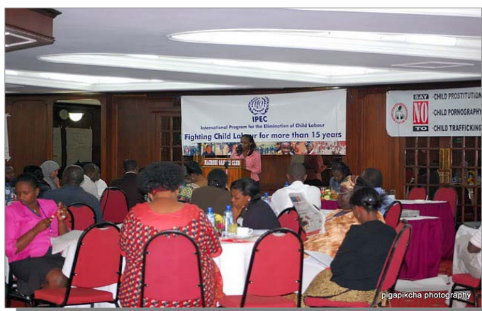
A meeting deliberating on the National Plan of Action on CSEC in progress in Nairobi, Kenya

The ECPIK secretariat, working in collaboration with member organizations and the Government of Kenya through the Ministry of Gender, Children and Social Development, held a consultative workshop on the development of an NPA on CSEC in June 2010. The workshop was supported by the International Labour Organization (ILO), which is tackling CSEC as a worst form of child labour in Kenya. The meeting was attended by representatives from the police, prosecution, Ministry of Health, Ministry of Education, the probation department, Kenya Hotel Association of Hotel Keepers, the judiciary and the civil society organizations and religious institutions. The objectives of the workshop were as follows: