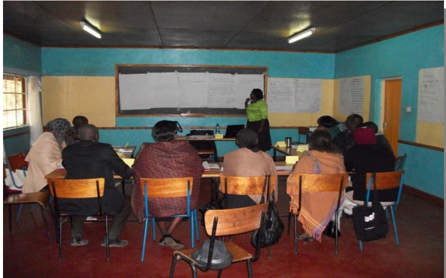
Child Participation Committee members attending a planning meeting in Loitokitok District

The planning meetings attracted 30 participants from both Busia and Loitokitok districts. The agenda for the planning sessions included restructuring of the child participation committees, conducting a capacity building needs assessment for the child participation committee, planning for awareness creation activities and identifying ten new schools to be enrolled in the child participation programme.