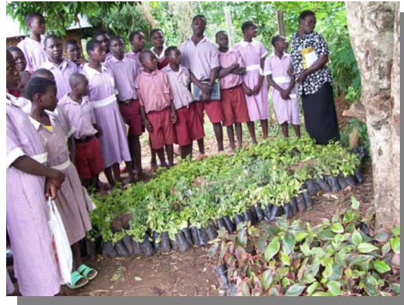
Child Rights Club members from Malaba Primary School in Busia District stand next to their flower / tree nursery, an IGA to the club

The Regional Office continued with the Child participation programme in two districts in Kenya. It has child rights clubs in ten schools in each district. This project is an interesting one as it is being replicated in Tanzania after demonstrating that the children can protect themselves. In the schools with clubs, the children are reporting cases of abuse and also monitor other children not attending schools. The children are reported to challenge their parents and even teach parents on children's rights and responsibilities. In short, the empowering of these children is evident and this programme needs documentation.