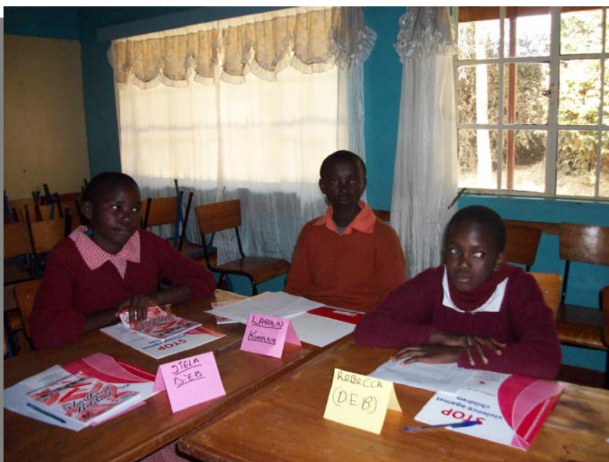
Some of the Child Rights Club members in Loitokitok District who attended a planning meeting in July 2010

Child Rights Clubs are established in primary schools and their main aim is to promote dialogue and awareness on child rights within their schools and communities. The clubs consist of thirty members and are guided by a patron and club officials. In June and July 2010, planning