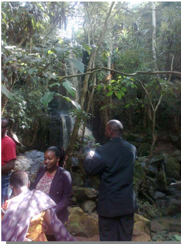
Some former and current FK Exchange participants during the bonding session at Paradise Lost, Kiambu

Bonding sessions are held every year and serve to bring together current and the just returned exchange participants in the FK programme to network and share talks on their progress on the