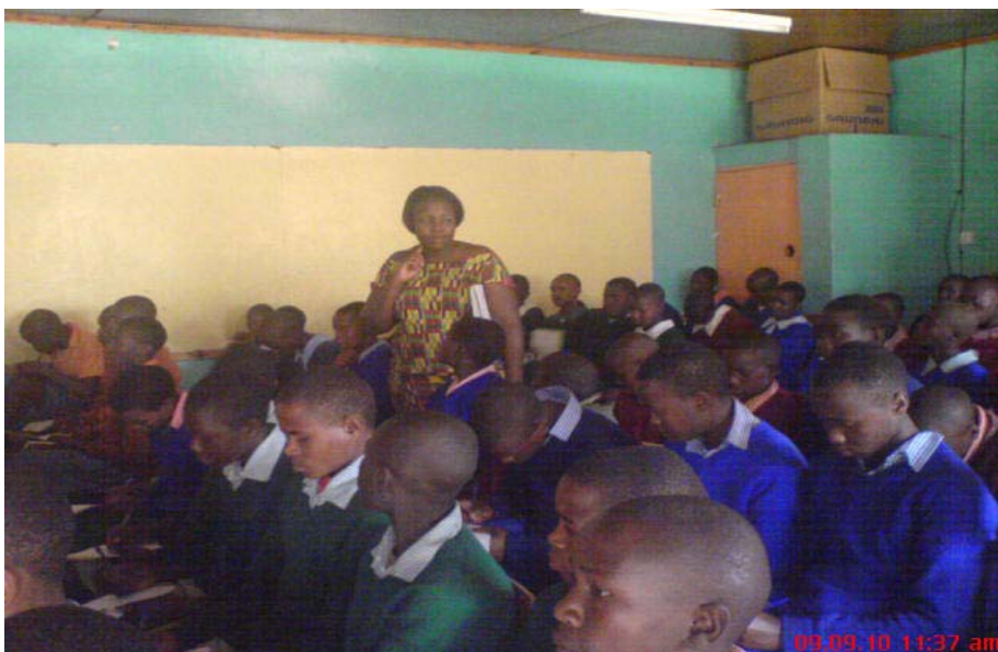
Child Rights Club members in Loitokitok District attending a training workshop on capacity building

The programme hosted two training workshops in Busia and Loitokitok districts for the Child Participation Committee and government actors to address the capacity needs identified during the planning period. The training covered areas such as child rights, abuse and protection, child participation, networking for child protection, resource mobilization for project sustainability and project monitoring. The actors also used the forum to share experiences on child protection.