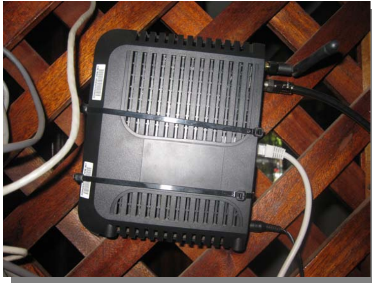
Maximizing research and information sharing through utilizing the fibre optic technology

ANPPCAN continue to maximize the use of information communication and technology (ICT). A dedicated local area infrastructure is already in place is a dedicated structure through which programme officers have an efficient and streamlined platform of accessing internet resources. The now fully operationalized local area network enables the sharing of facilities such as printers, streamlines communication and sharing of information amongst staff, and particularly its field offices as well. Later in the year, the organization moved to yet a faster internet infrastructure, the Fibre Optic, which has greatly improved