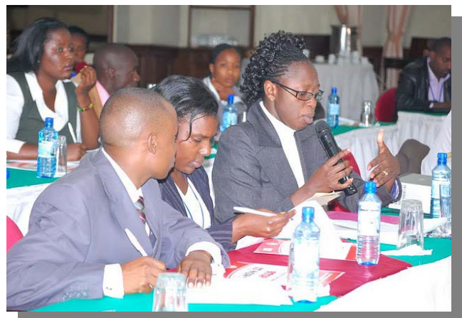
A section of delegates who participated in the sensitization workshop on child sex tourism for members of the judiciary

ECPIK held a consultative and sensitization workshop on Child Sex Tourism for magistrates, prosecutors, the police, probation officers and children's officers. Preceding this activity, the national coordinator held meetings with the Director of Gender and Children's at the police headquarters to make consultations and sensitize the office on the findings of the ANPPCAN's Baseline Survey on Child Sex Tourism (CST) as well as share ECPIK's plan of activities. Several other meetings were also held with the Department of Children's Services in the Ministry of Gender, Children and Social Development as well as the Ministry of Tourism.