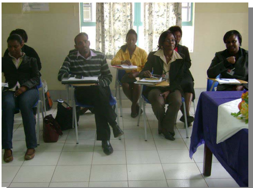
Staff from ANPPCAN's Child Protection and Response Centre in a meeting of the Nairobi Child Protection team

Monthly meetings were held with the key actors to review progress made and to discuss challenges and remedial actions. Five (5) network meetings were held in the year under review. Of the meetings, 3 were hosted at ANPPCAN Regional Office, 1 meeting was hosted at St. Johns Community centre, 1 meeting was hosted at Kenyatta National Hospital, GBV and the next meeting to be held in January 2011 is scheduled to be held at the Children's Legal Action Network (CLAN).