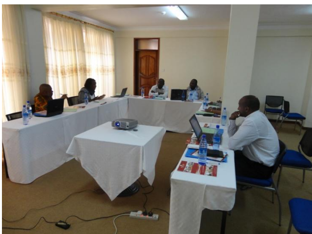
Chapter heads attending a review meeting of the Exchange programme in Kampala, Uganda

During the review meeting, it was noted some 13 Chapters had so far benefitted from the Exchange programme since its initiation. Majority of participants benefited tremendously from the programme, enhancing their personal growth. The meeting observed that the FK partnership and engagement had resulted in immense human development.