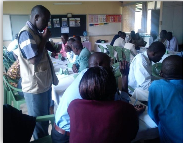
Parents from Busia District attending an entrepreneurial skills training at the Busia Training Centre

In both Busia and Loitokitok districts, training on entrepreneurship skills was conducted. Parents were trained on entrepreneurship using the Business Starter concept that highlighted the importance of planning in carrying out Small and Medium Enterprise (SMEs). The participants were trained on the requirements of a business venture, including development of a vision and mission, having a strategy in place, time management, proper planning, record keeping and a consistent saving culture. The goal of the training was to train parents on entrepreneurship skills to enable them establish successful Income Generating Activities (IGAs) and manage SMEs.