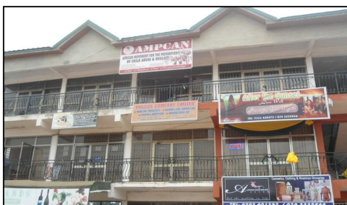
New Offices for AMPCAN Ghana, thanks to the capacity building programme

On its part, the Ghana Chapter focused on consolidating and strengthening the office, improving governance, resource mobilization and the development of a child protection policy. The Chapter appointed a Coordinator for the project. The Chapter was also able to recruit 2 more staff with different skills, including investment skills. The Offices of the Chapter were relocated to a more accessible location, where it was able to acquire office space for 3 years. The capacity building programme contributed some 20 percent of the cost of the offices.