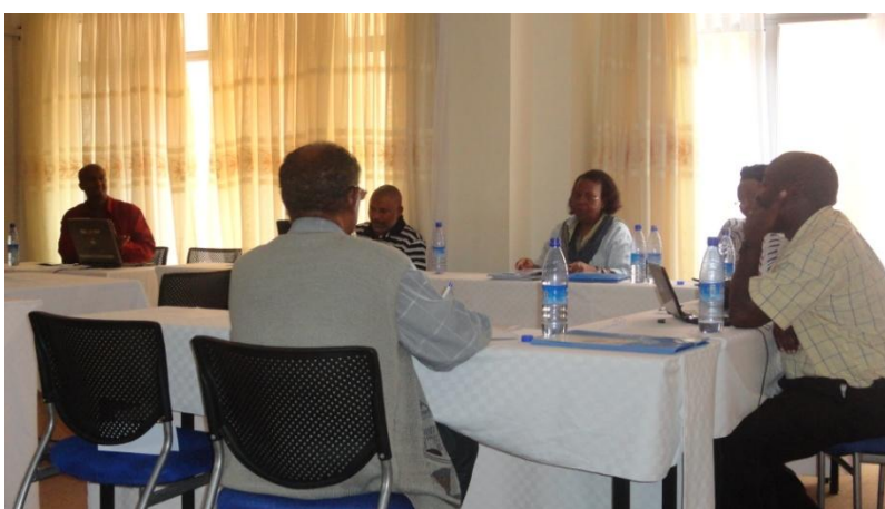
ANPPCAN Chapters hold a planning meeting for the 2012 phase of the Exchange programme in Kampala, Uganda

The planning meeting took place on 5 and 6 November 2011 in Kampala, Uganda. Four chapters, namely, Ethiopia, Liberia, Uganda and Zambia and the Regional Office took part in the planning meeting. The meeting took the chapter heads through the substance of the programme, including the brief description of the activities of the partners, what has been achieved through the Exchange programme so far, why the proposed (10 th ) round of