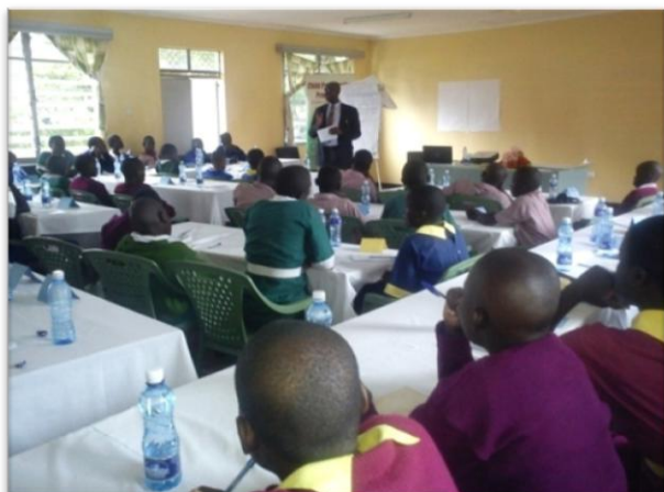
Child rights club members attending a training workshop at the Busia Agricultural Training Centre

In an effort to empower child advocates on child rights and child protection, two training workshops were conducted. The two workshops were conducted for Child Rights Club members and the Child Rights Club patrons/teachers in Busia and Loitokitok districts in the month of September 2011.