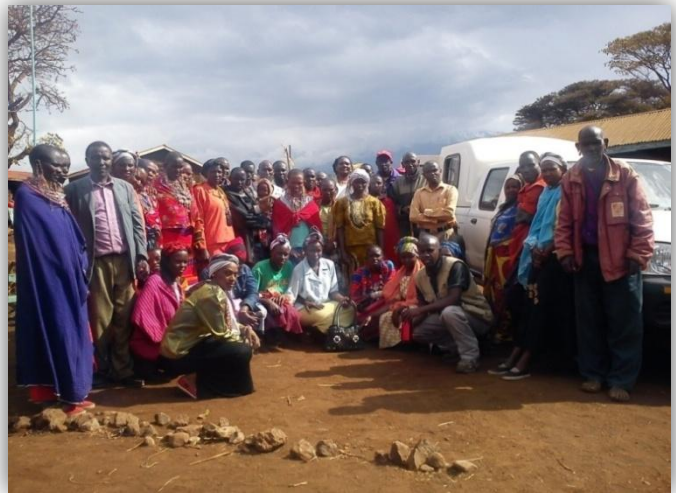
Parents, teachers, CRC Patron and CHD reps of Imurtot primary school attending a sensitization forum on child rights in Loitokitok district

The awareness raising activity was conducted in October 2011 in Loitokitok and Busia Districts respectively. Some 233 attended the meeting from the two districts. Of the number, some 105 parents were from Loitokitok District while 128 parents were from Busia Districts.