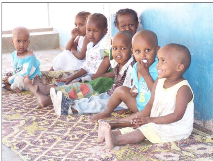
Protecting children is everyone's responsibility

In the year under review, the Response Centre responded to a total of 46 cases of child abuse and neglect. The cases ranged from neglect, sexual abuse, physical abuse, legal redress, to custody and maintenance. The cases that needed further interventions were referred to other network agencies or organizations that offer legal and medical or appropriate services. Periodical meetings with the key actors are organized to discuss challenges and to take remedial actions. Six (6) network meetings were conducted in 2011.