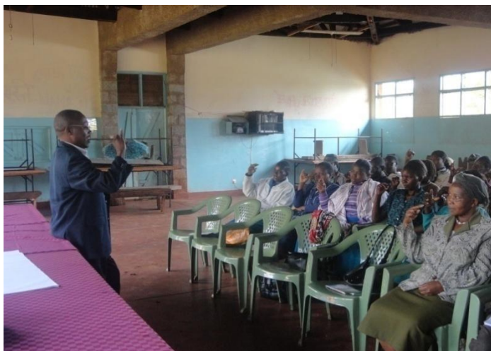
Training parents the sign language to enable them effectively communicate with their deaf children

In the year 2011, two phases of parents' trainings were conducted. The first phase of the parents' training took place in April-June 2011. A total number of 730 parents attended the training from Kitui, Kajiado, Embu and Mumias. Topics covered included the definition of Special Education terms, the parts and function of the ear, causes and prevention of deafness, manual alphabets and finger spelling, and the Kenyan Sign Language (KSL) numerals 1 - 1000. Other topics were parenting skills and child's rights, the Kenyan Sign Language – families, towns, pronouns, verbs, adjectives, regions, occupation, clothes, food, school, identification, intervention, hearing aids and services available to the deaf.