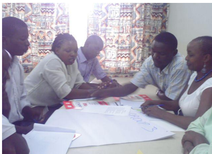
Participants in a group work session deliberating on policies and mechanisms to protect children online

It was also observed that the current online applications (internet, chat, online game, downloading, social networks) can cause serious risks and harm to children through sharing personal information, trusting people met online and playing games with unknown people. Further risks could be encountered through sharing, posting photos, viewing and distributing pornographic films generated using webcams with unknown people. Useful recommendations were drawn which will go along way in protecting children online.