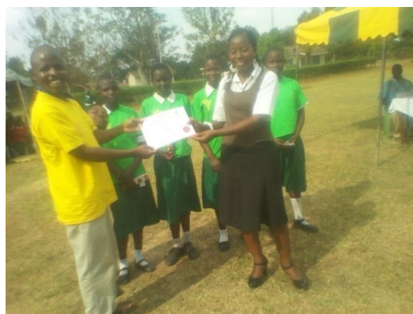
A student receives a certificate for taking part in the Child Participation Music Festival in Busia District

In the year under review, a music festival was held in which a total of 30 schools took part. In Busia District, the event was held at the Busia Agricultural Training Centre in March 2012 with some 156 participants turning up for the event. Those that attended the music festival included CRC members, school head teachers, parents, child rights club patrons, CHD representatives and the District Child Labour Committee (DCLC) members. In Loitokitok District, the event was held at the Loitokitok Social Hall on 10 March 2012 and was attended by 150 participants. These were CRC members, CRC Patrons/CHD representatives, parents and Child Participation Committee (CPC) members. The Child Rights Club members