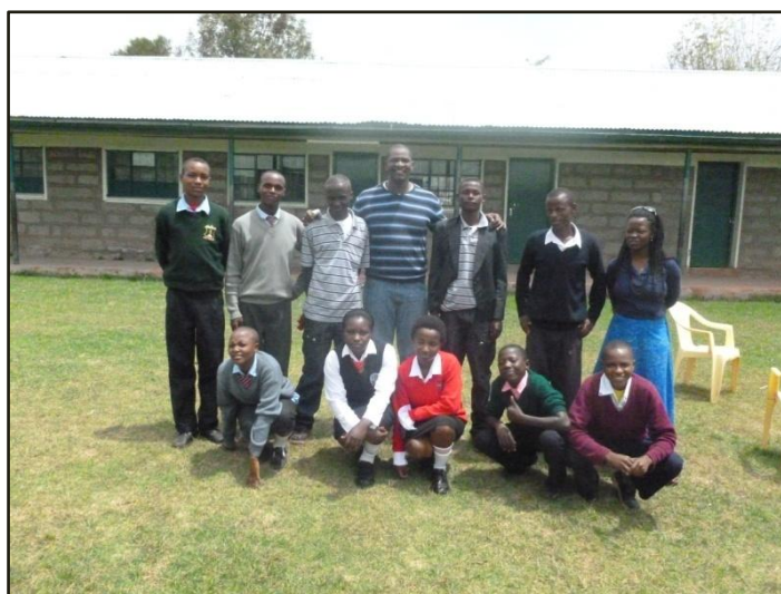
AKIN students pose for a photo with the Centre staff during a school visit

In the beginning of the year, parents whose children joined vocational training and secondary schools were invited to ANPPCAN to let them know their role in the welfare of their children. Each parent was met individually, their strengths, capacities and resources assessed to involve them more in the general education of their own children.