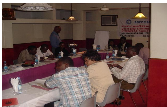
Some of the ANPPCAN Tanzania chapter members in the constitutional review process

The review recommended the need to develop a Strategic Plan, in which strategic objectives such as to strengthen the capacities of the board members and staff on their roles, recruitment of new members, mobilizing resources, re-structuring of the organization and the delivery of services are clearly stated. The findings were disseminated to the board, staff and other partners. A consultant was then hired to develop a 5 - year Strategic Plan, using the information obtained from the review.