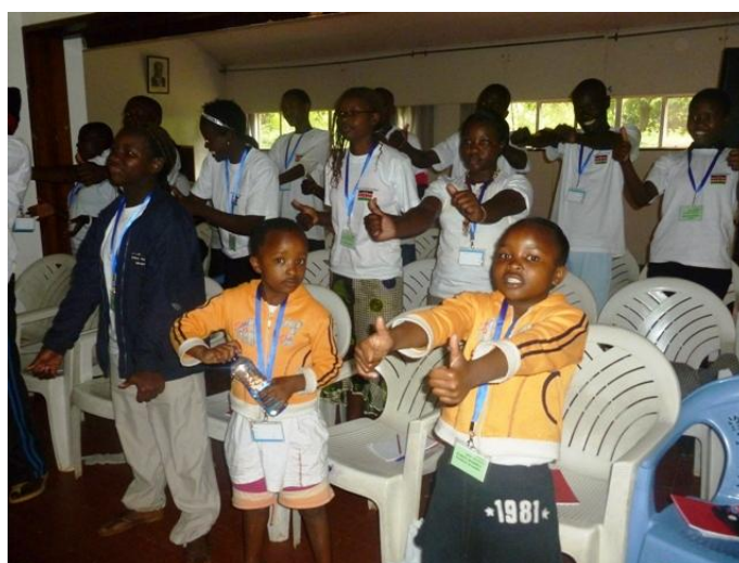
AKIN students during a retreat in Nairobi, Kenya - the programme supports education of needy children in Kenya

The month of January was one with several activities. Meetings between guardians/parents and ANPPCAN were held to clarify roles each stakeholder would play to support the needy students in schools. The enrolment process was also carried out and this involved family assessment, detailing their economic status and capabilities to support their children's education. The guardians and parents were given the role of school search and provision of personal effects for their children and they were of much help in this process. They had the will and zeal to witness their children actualize their career dreams despite their economic challenges.