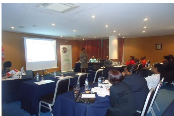
Training on good management and governance in Mozambique

An extraordinary General Assembly meeting was held at ANPPCAN Mozambique office in May 2011. During the occasion, using the knowledge and experience gained at the Leadership Forum in Kenya, the President and the Executive Director facilitated a 1-day training and reflection session that covered organizational leadership, review of the constitution and the strategic plan, recruitment of members and resource mobilization.