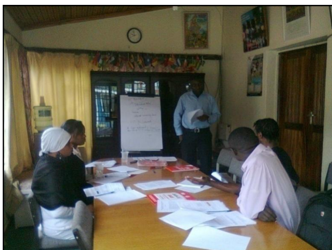
Compilation of data by the research team at ANPPCAN Regional Office

The rapid assessment of the use of internet and other ICTs by Children in Nairobi District was held in the month of September. Some 400 children, youths, teachers and cybercafé operators in 8 different districts in Nairobi participated in the study. The study was conducted by the End Child Prostitution in Kenya (ECPIK), with the support of ECPAT International. The study was part of the ICT Research in Africa as a regional initiative involving 5 countries, namely, Cameroon, Gambia, Togo, Kenya and Uganda and done within the Youth Partnership Project (YPP) framework.