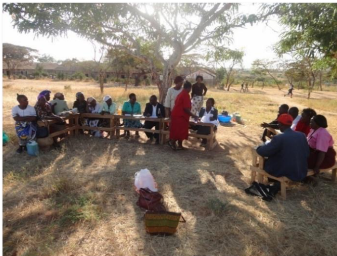
Parents' cluster meeting in session

Parents of deaf children support groups continued to meet on a monthly basis as had been scheduled in all the regions. Mumias and Embu regions had impressive attendance. The Kitui and Kajiado parents' meetings in the quarter were largely affected by the drought situation in Kenya. Low turn up and increased trend of parents' absence during monthly meetings was witnessed in Kitui and Kajiado regions up to the month of November 2011.