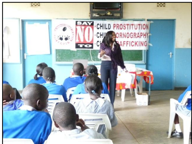
Training for school child rights clubs on protecting children while online

Nairobi Pentecostal Primary School students noted that internet is used on the computer for sharing information, used to send email and to chat. Generally, the students were quite conversant with the use of the internet, including online games, face-book and online chats. Most of the children said that computers, laptops and phones could be used to access the internet. The most surprising thing was that the students knew about the I-PAD and also mentioned this as a way to access the internet. The students promised to engage others with messages on internet safety, by displaying the MIS materials in their classes, talking to them during the school assembly, holding an MIS day in their school where they will have MIS material and wear MIS t-shirts.