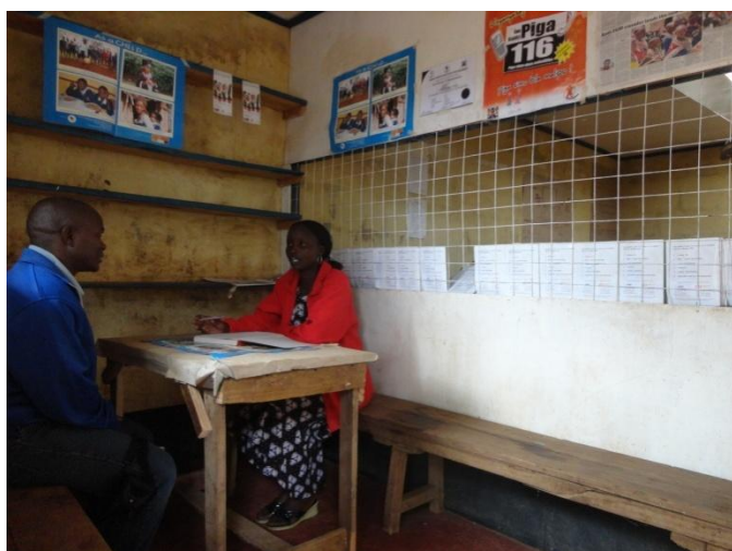
A CHILD HELP DESK - a teacher speaks to a visiting officer from Malawi at the CHD in Loitokitok District

In an effort to enhance child protection, the child help desk representatives with the help of the school administration established 10 new child help desk in the new schools added in the programme. Children from new schools have been sensitized on the child help desk and are now reporting cases of child abuse and neglect. Insufficient resources for setting up the child help desks and uncooperative teachers/schools administrations were cited as the major challenges.