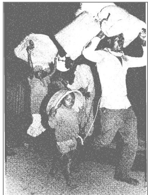
Conflicts leading to migration of persons is a challenge in the Horn of Africa