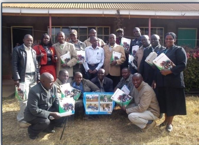
Chiefs from Loitokitok District who attended a sensitization forum on child rights

Sensitization forums for the provincial administration (local chiefs) on child rights and child protection were conducted in the month of August in Busia and Loitokitok districts. Some 42 participants, mainly the chiefs, attended the sensitization forums. In Busia District, the sensitization forum was officially opened by the District Commissioner while in Loitokitok District, the forum was opened by the District Officer One (1). The need to sensitize the local provincial administration was recommended by the CRCs members who identified them as being key in enforcing the law.