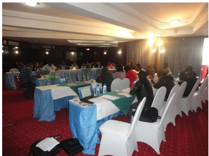
A meeting of the Nairobi Child Protection Team in session

During the quarterly meetings, major recommendations that came up were to cascade the model of NCPT to the counties and grassroot levels and enhancing work at the sector working group level that include psychosocial, legal and medical personnel to better handle cases and strengthen the referral system. Creating child protection teams at grassroot levels ensures that organizations at that level adopt most of the