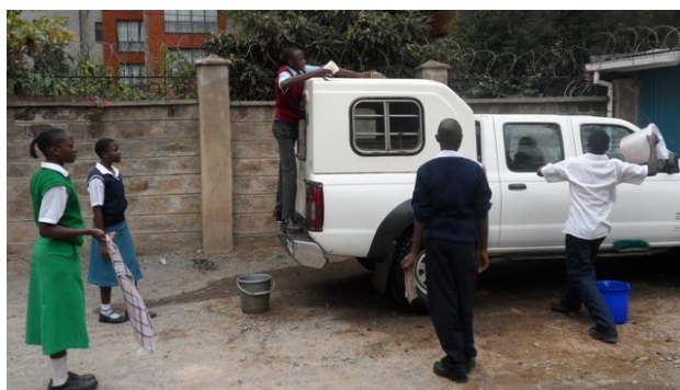
Students at ANPPCAN Regional Office during the Open Day demonstrate their community social responsibilities by cleaning the compound and cars

Besides parents and guardians facilitating the payment of school fees for the children, the programme strengthened family relationships and boosted their income through Income Generating Activities. This year, two families were supported with capital to start some form of business for family upkeep. One family, headed by a widow, was supported with a sawing machine for a tailoring business while the other was supported with start-up capital for charcoal business. Follow up home visits were carried out to strengthen family ties and to spruce up business ideas and monitor on-going business enterprises to augment family income.