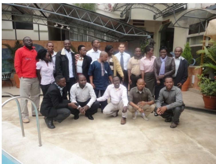
Staff from ANPPCAN attending a Monitoring and Evaluation (M&E) Training in Nairobi Kenya

Elsewhere, staff from ANPPCAN Regional Office and the network in Africa participated in a training on monitoring and evaluation in Nairobi, Kenya. In the training, the staff benefited on knowledge and skills on monitoring and evaluation and carried out practical M&E exercises based on on-going projects in their offices. The training was hosted by the University Research Co., LLC (URC), USA. Chapters that were represented at the training included Tanzania, Uganda, Liberia, Nigeria, Senegal and Kenya.