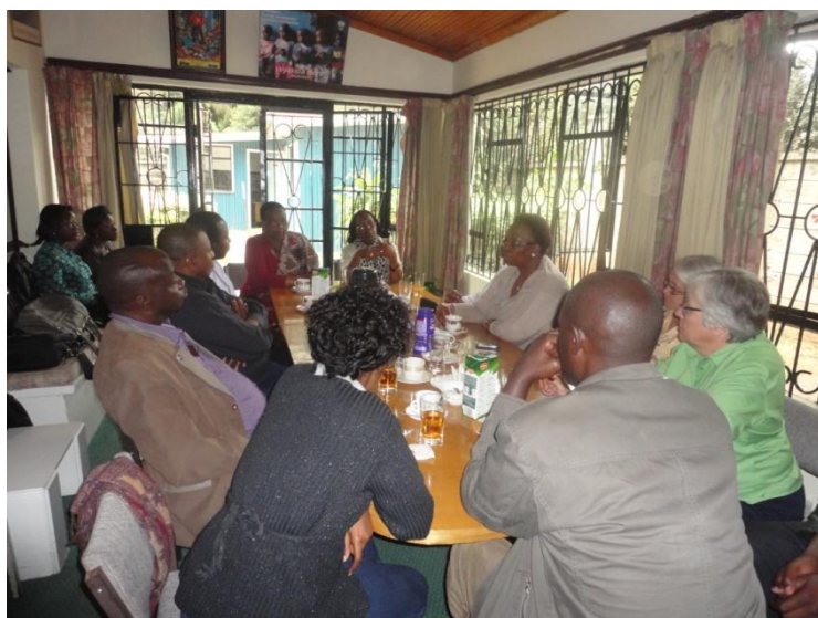
Representatives of TWGs from Uganda, Tanzania Swaziland & staff from URC visiting the ANPPCAN RO during the regional meeting on PCCPS held in Nairobi Kenya

ANPPCAN Head Office received a number of visitors in 2013. These were either individuals from partner organizations who were seeking to build partnerships with the organization on joint programming or who were visiting the organization to learn and familiarize themselves with its programme focus.