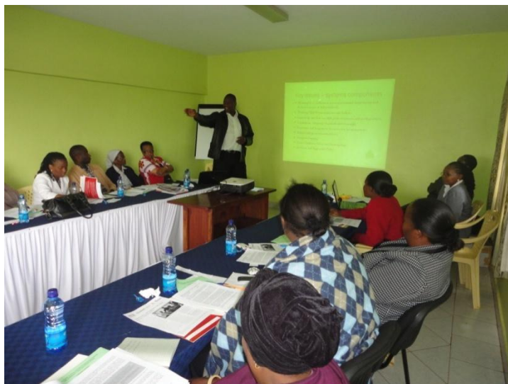
A district meeting in Dagoretti District in Nairobi countries was presented

Specifically, the district level groups identified the major issues affecting children in their districts, mechanisms and structures available for child protection, role of communities in preventing and responding to violence against children and recommendations to strengthen Child Protection Systems. Finally, the district level identified two communities per district where the project would conduct community conversations on child protection systems. In Kenya, the communities chosen were Kayole and Mukuru in Embakasi District and also Kawangware and Mutuini in Dagoretti District. In Uganda, the district level meetings identified Layibi and Omel communities in Gulu District and Goma and Nagojje communities in Mukono District.