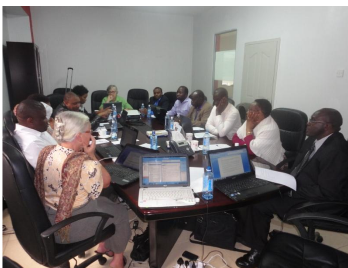
Members of the TWG during the regional meeting on PCCPS in Nairobi. A synthesis report on PCCPS covering the four countries was presented

The synthesis report revealed that community child protection mechanisms should ideally interconnect with national child protection systems via referral, information sharing, supervision and monitoring, among other aspects. This in reality does not take place across the four countries. In addition, the recognition of formal and informal mechanisms is seldom there across the four countries except for Kenya where community elders have been recognized in the country's national child protection framework. A two-day regional meeting for members of the TWGs and representatives from key government departments charged with child protection from the four countries to validate and give input on the report was held in Nairobi Kenya in July 2013.