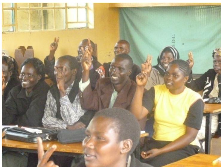
Parents Support Group members in Kapsabet County practising the Kenyan Sign Language

A total of 583 family members and 70 service providers were trained on the Kenyan Sign Language (KSL), policy advocacy, resource mobilization techniques and services available to families living with deaf children. The monthly Parent Support Groups (PSG) meetings also took place in all the counties. Subsequently, the PSG members were able to learn the Kenyan Sign Language, plan and execute their PSG activities well, including, PSG trainings, income generation projects, and recruitment of more parents of deaf children to join the PSGs, as well as providing psychologically support to parents of deaf children.