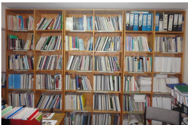
A section view of ANPPCAN RO Resource Centre. The Centre is a repository of information and works on child rights and child protection

The Resource Centre receives and organizes information materials and provides access to readers both staff and readers from other institutions. The Centre has accumulated a wide range materials from ANPPCAN's work and that of other organizations. The resource centre is an important referral point for information, books, and reports and journals on children issues for child rights actors and students from local universities and colleges.