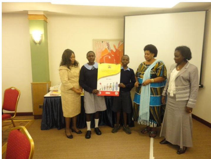
Officials from the National Council for Children Services, Kenya, and children during the launch of the National Plan of Children against sexual exploitation of Children

The NPA has been developed around the areas of prevention, protection, recovery and re-integration, coordination cooperation, child participation as well as monitoring and evaluation. It is anticipated that through the plan of action, adequate resources will be allocated for the prevention and children from sexual exploitation.