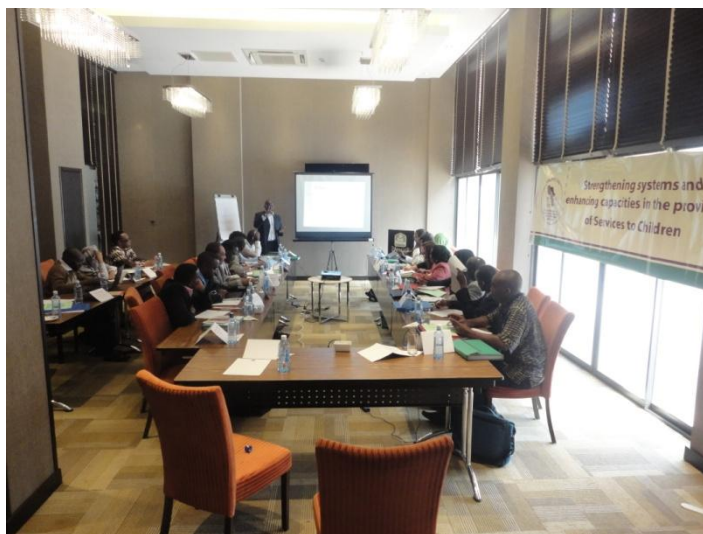
Members of TWG from 7 countries of the EA region take part in a regional planning meeting on NCPS. A regional strategy on NCPS was presented during the meeting

The regional planning meeting for strengthening National Child Protection Systems was conducted on 4 - 5 July 2013 in Nairobi, Kenya. The meeting brought together 22 participants drawn from the Child Protection Technical Working Groups (TWGs) in the seven countries. The meeting created a platform where the Regional Strategy on strengthening NCPS was presented and endorsed by representatives of TWGs from the seven countries.