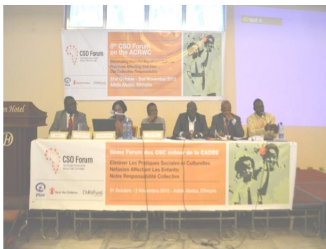
The civil Society Organisation Forum in session in Addis Ababa, Ethiopia. The forum came up with far reaching recommendations on the ACRWC