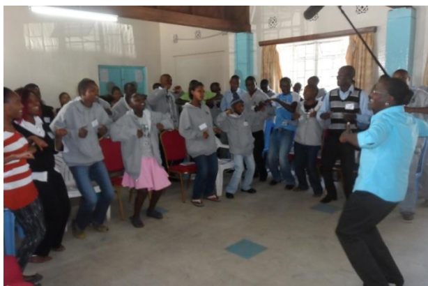
AKIN students during 2014 a retreat at YMCA, Nairobi. The facilitator illustrates the different types of personalities

purchasing of personal effects and transport fee for the students to report at their learning institutions.