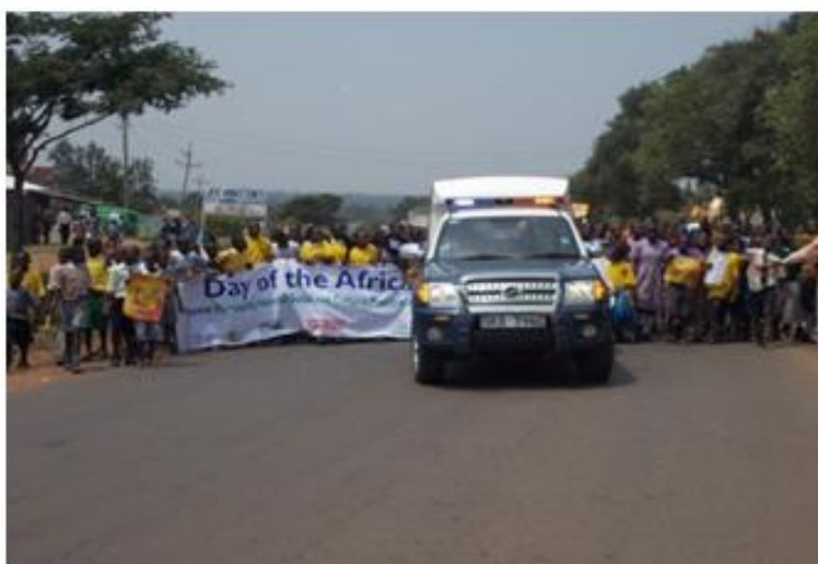
Child Rights Club members with other children from Busia County marching to advocate for their rights during the Day of the African Child

The 2013 theme for the Day of the African Child was “Eliminating Harmful Social and Cultural Practices Affecting Children: Our Collective Responsibility” and CRC members and their patrons/teachers used the Day to advocate for child rights and protection. In Busia County, the Day was held on June 2013 at the Nambale Polytechnic Grounds in Nambale District. Some 214 participants of whom 180 were child rights club members from 18 schools attended the celebrations. In Loitokitok district, the forum was held at the Loitokitok Catholic Church Multipurpose Hall in June 2013 and was attended by 140 participants with 118 being child rights club members and 32 child rights club patrons and child help desk representatives and government officials.