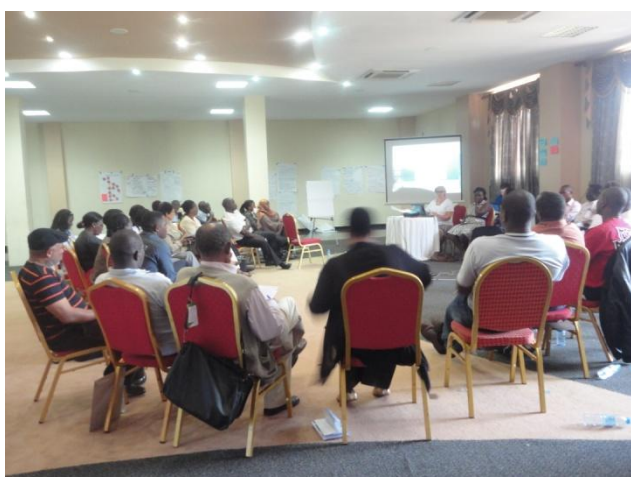
Staff from ANPPCAN attending a Quality Improvement Training organised by URC in Kampala Uganda

At ANPPCAN, we welcomed the Partnerships for Community Child Protection Systems as it complemented the one that the organization has been running in the past year on National Child Protection Systems (NCPS), covering seven countries in the Eastern Africa region. The project provided an excellent opportunity to link the formal child protection systems with the informal child protection systems and also help in identifying good practices for child protection at the community level for replication and scaling up.