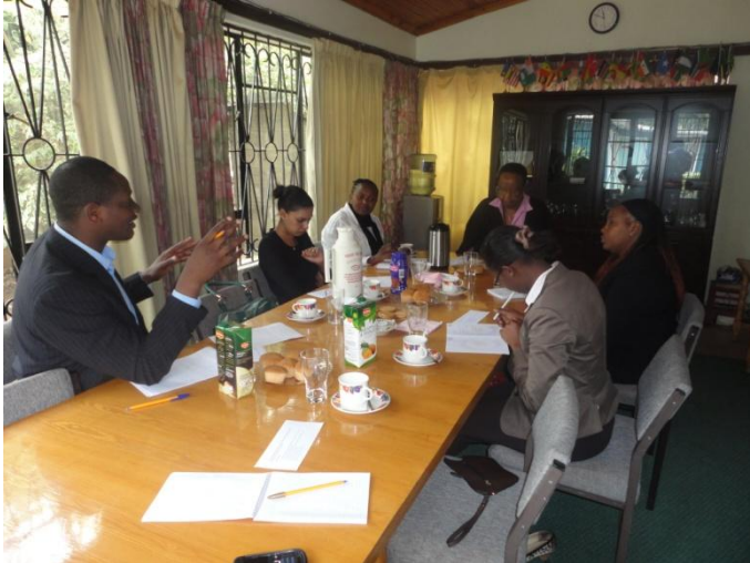
Members of the Regional Reference Group on Corporal Punishment in a meeting at ANPPCAN RO. ANPPCAN RO is chair of the Group

On their part, the Regional Reference Group meetings brought together organizations working in the areas of corporal punishment. These were ANPPCAN Regional office, Parenting in Africa Network (PAN), Investing in Children and their Societies (ICS), Save the Children International (SCI) and Terre des Hommes (TDH). The meetings provided an opportunity for the organizations to present their work on corporal punishment and positive child discipline. The discussions brought out the need to include parents in corporal punishment initiatives, an area that most families find a challenge.