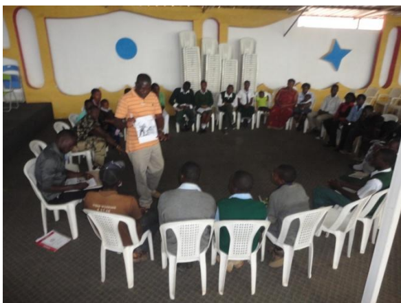
A facilitator conducting community conversations for 15-21 year children in one of the communities in Kenya

facing children. These were drug and substance abuse, child labour, sexual abuse and exploitation, child gangs, insecurity due to high crime rate, early marriage, poverty leading to malnutrition and lack of basic needs, denial of education, lack of legal documents such as birth certificates and neglect.