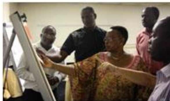
Staff from ANPPCAN and REPSSI during a planning meeting for the PCCPS in Johannesburg, South Africa, in February 2013

2013 began with a planning meeting on the Partnerships for Community Child Protection Systems that was held in Johannesburg, South Africa. The meeting was hosted by the University Research Co., LLC (URC) based in the USA and was attended by staff from ANPPCAN Regional Office, the Regional Psycho-social Support Forum (REPSSI), based in South Africa, and URC representatives in Uganda and Ethiopia. During the meeting, an implementation framework for the project was drawn and ANPPCAN and REPSSI embarked on developing the project proposal. Actual project activities started in July 2013.