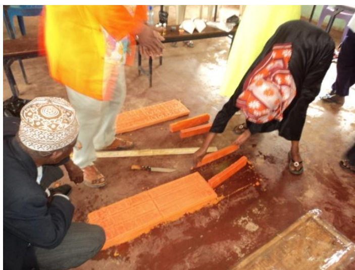
Members of the Mbaleni Parents Support Group in Kwale County making soap – an income generation activity of the group. The soap is sold to schools and the community members

As a result of the positive impact of project activities in Kwale sub-county, ANPPCAN was nominated to the Msambweni District Development Committee (DDC). The Committee brings together all heads of government departments and non-governmental organizations in the sub-county. ANPPCAN was also invited to the Msambweni District Development Partners Forum, a platform of different NGOs working towards harmonizing their activities in the county. This will enhance the creation of linkages for the parents and give the program visibility.