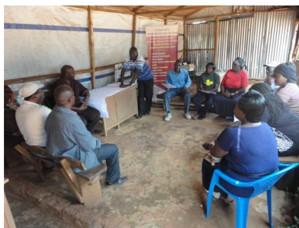
Community conversations for community leaders Dagoretti district in Kenya

During the community conversations, useful information emerged on some of the key problems