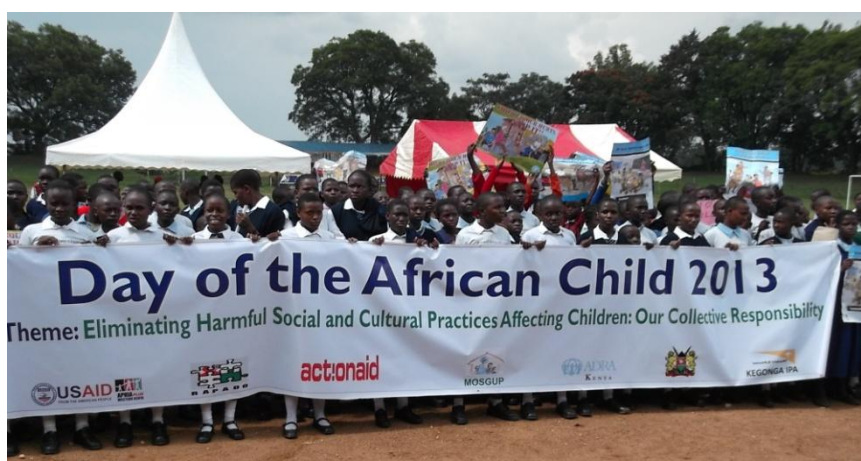
Deaf Children celebrating the Day of the African Child (DAC) on 17 June 2013 at Milangine District Commissioners county hall

The PSG members have been in the forefront in creating awareness on deafness within their communities. In Nandi County, for instance, the Kapsabet cluster group engaged in media advocacy and issues of deafness were aired by Sayare TV, Kass FM and West FM radio stations. Efforts made by the parents under the guidance of EARCs and ToTs has seen 47 more parents of deaf children being recruited to the PSGs and their deaf children admitted to various schools of the deaf.