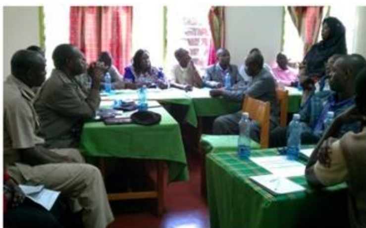
Kenya – Tanzania cross border stakeholders meeting at Kibolopes Cottages in May 2013

The programme conducted trainings on child rights and child protection at various levels targeting different groups. For instance, trainings for school head-teachers on child rights and child protection was conducted in Busia and Loitokitok districts in January and February 2013 respectively. In Busia district, 19 participants participated in the training, whereas 22 participants attended the training in Loitokitok District.